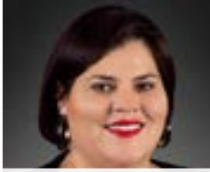
Raquel Terán D INCUMBENT SENATE

Raquel Terán is the State Senator for District 29. She is a member of the Appropriations Committee, Commerce Committee, and the Health and Human Services Committee. Raquel has been active on community issues that include democracy for all, education, voting rights, criminal justice, and climate change.